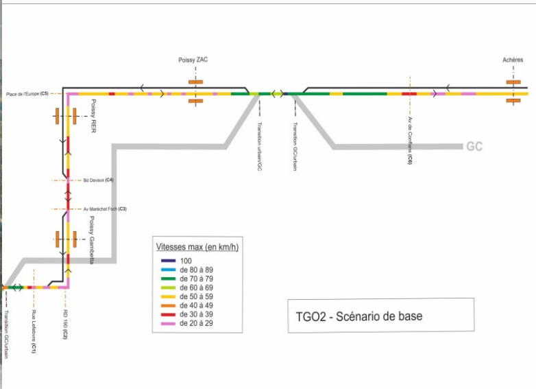
Maximal speeds along the line