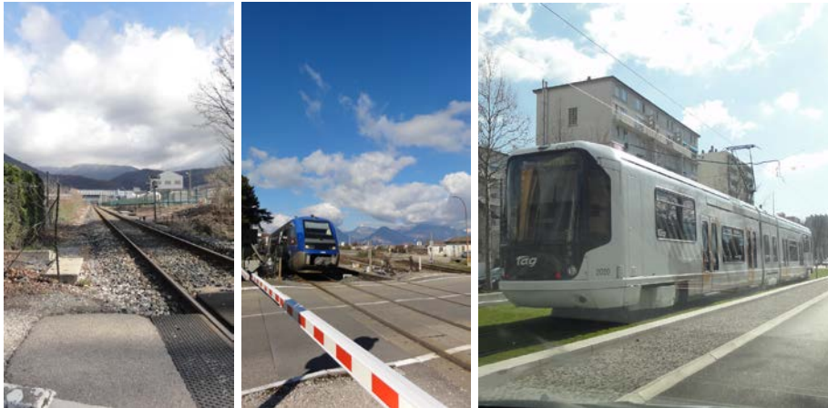
Few pictures of the existing tracks and services in the area