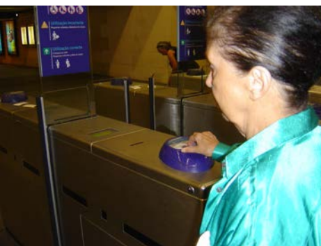
Magnetic paper and smart card ticket readers in one gate system (Lisbon, Portugal)