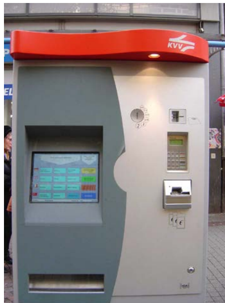
Comparison of old and new ticket vending machines in Karlsruhe (Germany)