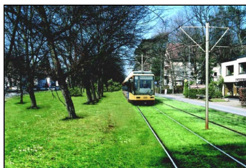
Trick photo after