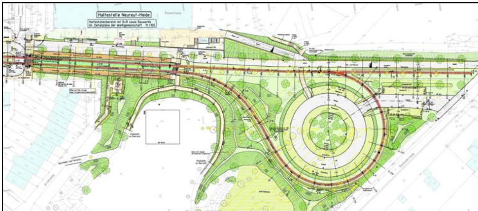
Design plan from the end stop with turning loop and siding