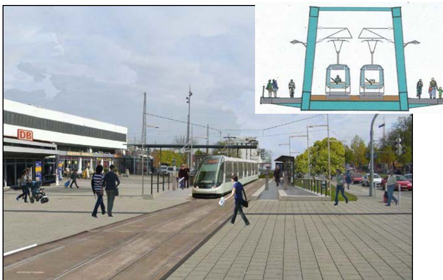
Photomontage of the station forecourt Kehl

The city of Strasbourg (CUS) and the city of Kehl are planning the extension of the Strasbourg tram line D as a cross-border tram connection over the river Rhine to Kehl. For the moment the terminus is foreseen at Kehl's station forecourt.